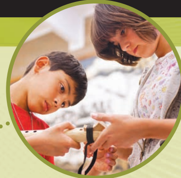
Sky Valley Indian Education