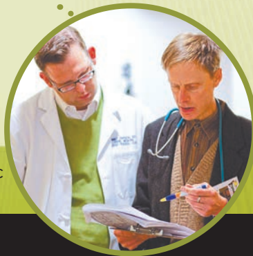
Safe Harbor Free Clinic