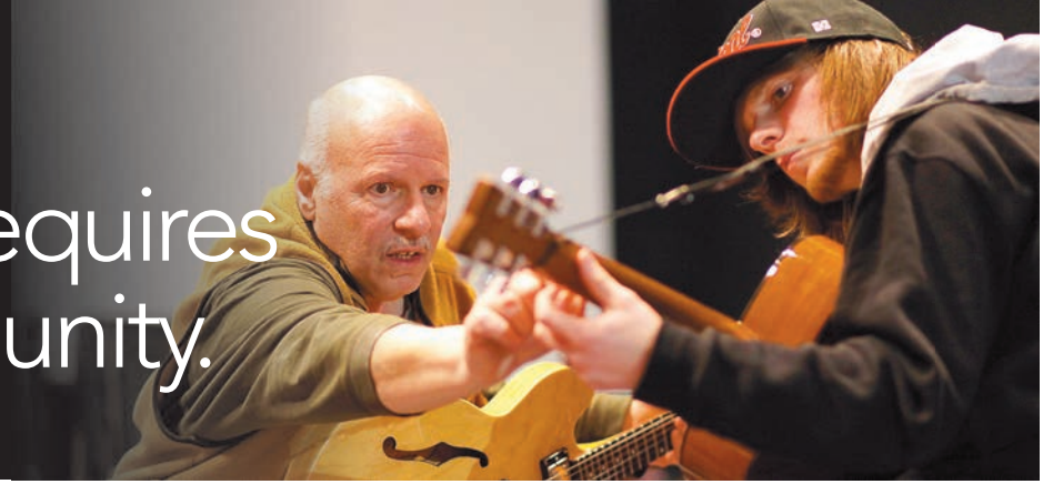
Snohomish County Music Project

Return on investment requires an investment in community.