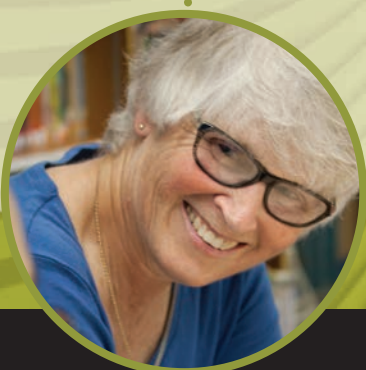
Everett Public Schools