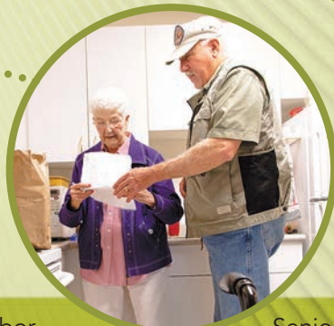
Senior Services of Snohomish County