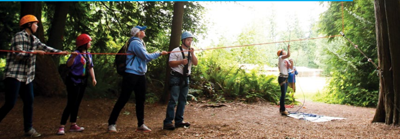
Camp Fire Snohomish County

COMMUNITY FOUNDATION of Snohomish County